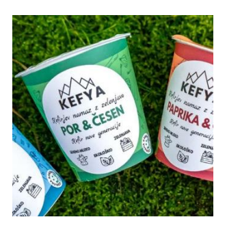
Communication Strategy prize to Slovenia With Kefya , a pancake premix with dried vegetable powder.