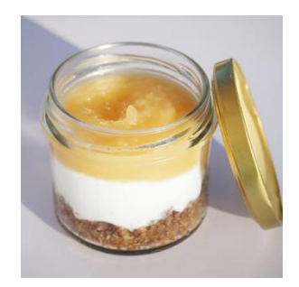
Gold Prize to France With oRIZginal, a tasty plant-based dessert made from organic French ingredients!